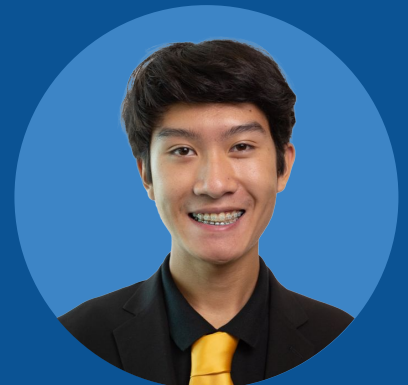
Division 44 West Lt. Governor Email: d44w.ltg@cnhkeyclub.org