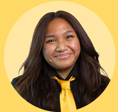
Division 28 South Lt. Governor Email: d28s.ltg@cnhkeyclub.org