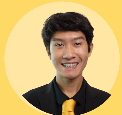
Division 44 West Lt. Governor Email: d44w.ltg@cnhkeyclub.org