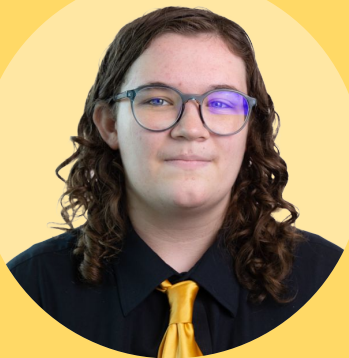
Division 38 West Lt. Governor Email: d38w.ltg@cnhkeyclub.org