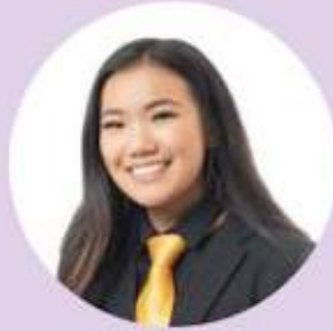
D23 LTG Grace Yim